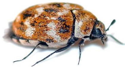
Carpet beetle ( Anthrenus verbasci )

Dr Peter Ingham of Wool Research in New Zealand adds: "There have been a number of cases of beetle larvae showing resistance to permethrin (the chemical most often used in insect resist treatments) but clothes moth larvae (the most common species attacking wool) are generally well controlled. In our experience, most of the cases of insect attack by moth larvae are the result of no treatment or serious under-treatment.